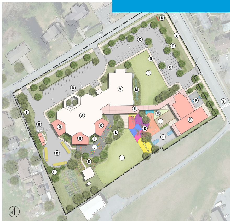
THE CINDY PLATT BOYS & GIRLS CLUB