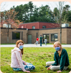
a safe environment