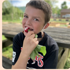
meals and snacks